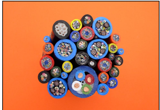
A selection of underwater cables