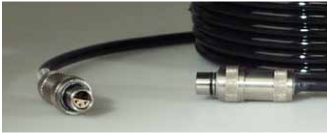
Cable 3296/3964. Connecting cable 10 pin to 6 pin