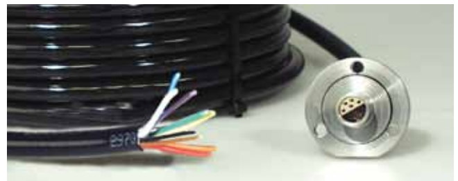
Cable 3976*. Flange Connecting cable 10 pin to free end