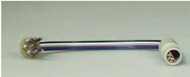
Cable 3854. Connecting cable 10 pin to Cell Plug