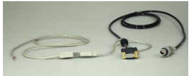
Cable 3855. Connecting cable for PC