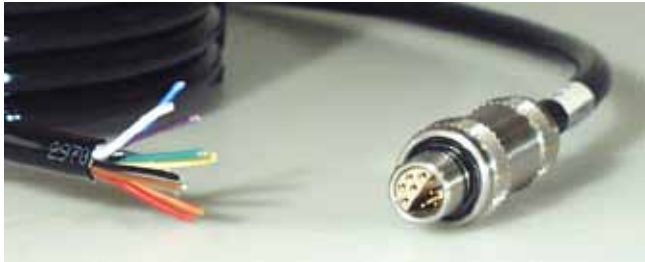
Cable 3485. Connecting cable 10 pin to free end