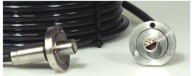
Cable 3980*. Flange Connecting Cable 10 pin to 10 pin

*) used with Coupling 3979 for 36mm sensors and Coupling 3977 for 40mm sensors.