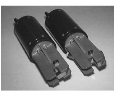
Small portable pair of remote release untis with separate battery pack transponders and Transponder Control Unit (TCU) with Remote Active Transducer (RAT)